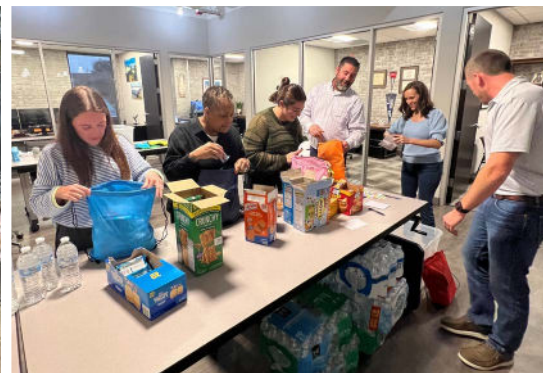
Omega Spreads Kindness with Blessing Bags