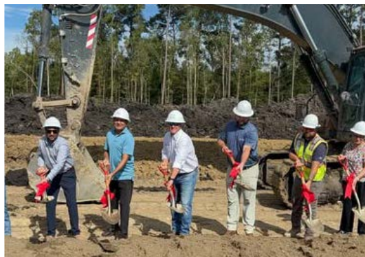
Avid | Candlewood Hotel ground breaking, Richmond Hill, GA