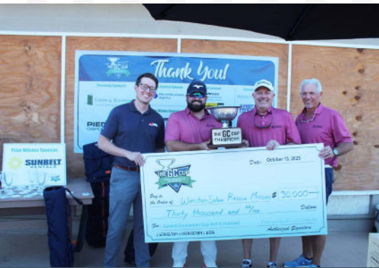
Omega Claims Victory at the 2025 Annual GC Cup Golf Invitational