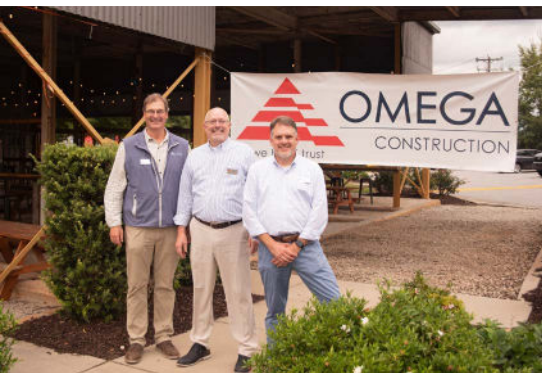
50 Years Strong: Celebrating in Greenville, SC