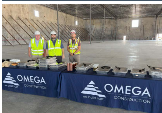
TRT International in Rincon, GA Officially Tilted-Up