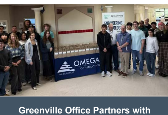
Greenville Office Partners with Greenville Tech to Support CETAET Program