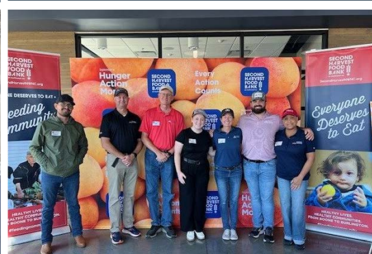
Omega Volunteers with Second Harvest Food Bank of Northwest NC