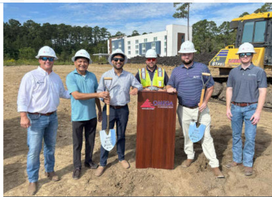
Avid | Candlewood Hotel ground breaking, Savannah, GA