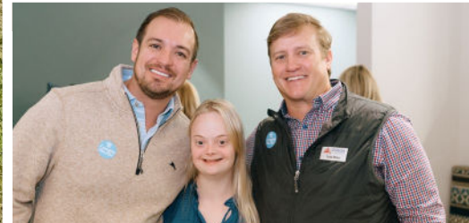
ESP's (Extra Special People) Java Joy Launch week at the Savannah office