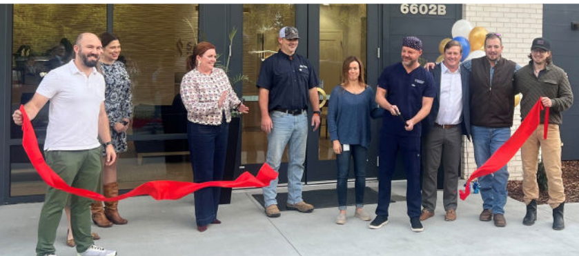
Savannah Facial Plastic Surgery Center Ribbon Cutting