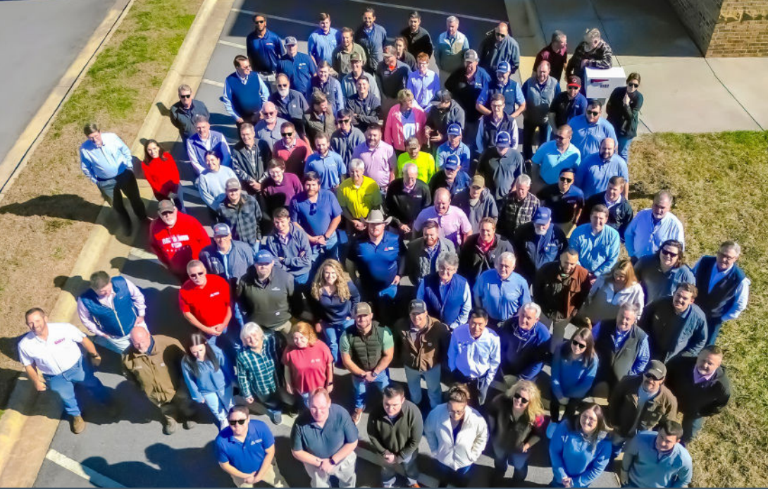
2025 Annual Meeting